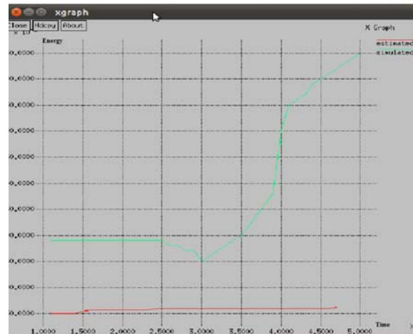
Fig 4.1 Network Throughput

Fig.4.1 illustrates the network throughput for vertical handoff and network with some theoretical values, as a function of mobile nodes' speed for Ad-hoc networks of 25 nodes, respectively Average network throughput for vertical handoff using overlay network with mobile nodes moving with a maximum speed of 20 m/s and for a pause time of 30. At the speed variation from 0 to 20 m/s, protocol attains improved throughput performance of vertical handoff. If result is analyzed, note that even if the throughput of first reference is lower than that of vertical handoff for a maximum mobile node speed inferior to 20 m/s it monotonically increases for higher maximum speeds until it reaches approximately 19,000 bits/s at 40 m/s. Hence, the lower throughput found at 10 m/s is largely compensated by the throughput in the 20–40 m/s interval. This increased performance can be attributed to the Link quality, security and stability mechanism of the protocol used. The network becomes more stable because of the high pause time.